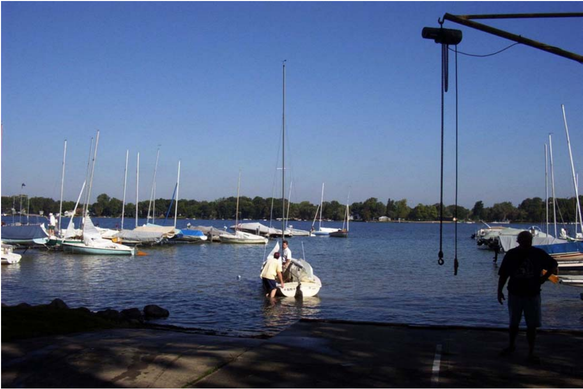
Boat launching area and beautiful Clark Lake.