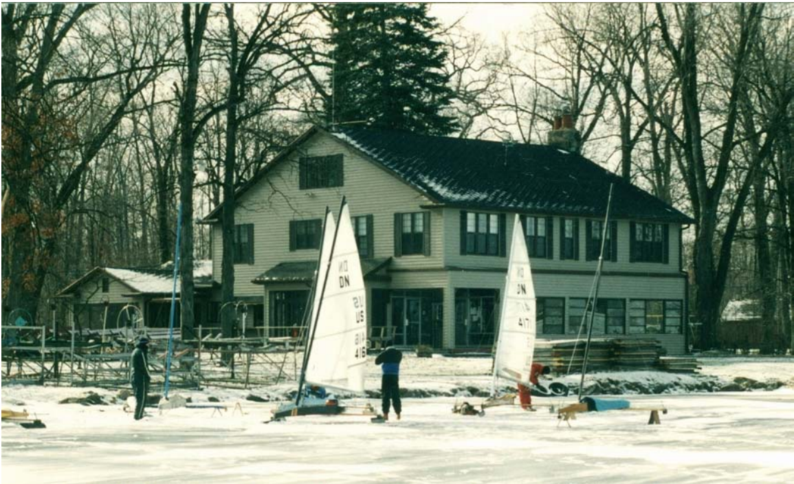
Sailing continues through the winter at CLYC.