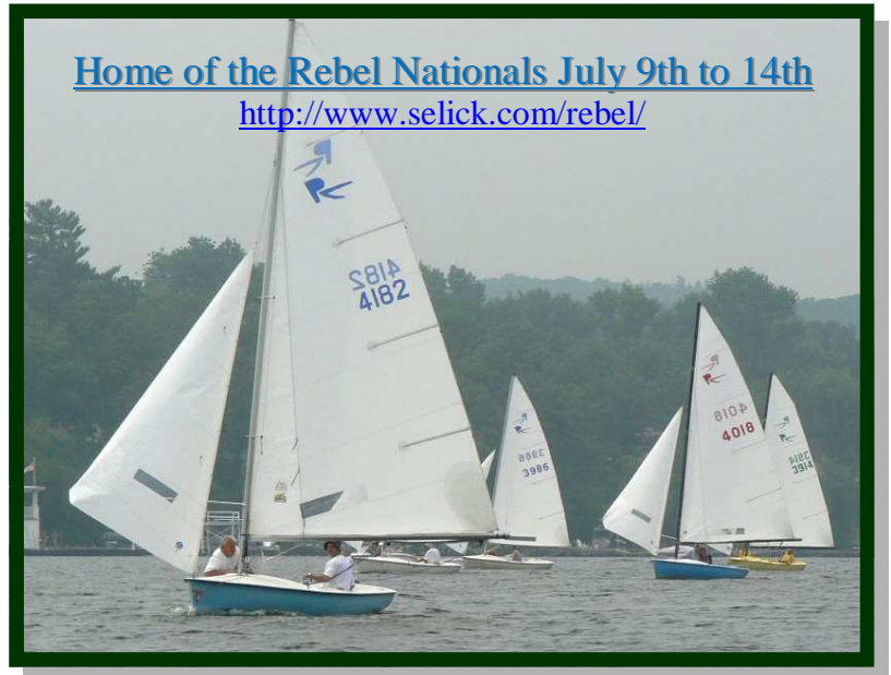
2007 Pictures at: